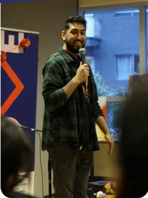
Parvi performing standup, Dec 2023

LOVE BC highlighted the Winterfest with a vibrant open mic featuring over 20 youth from diverse backgrounds. Our stage became a platform for young voices to shine through poetry, music, and stand-up comedy, celebrated in a multitude of languages. This unique opportunity not only showcased incredible talent but also fostered a sense of belonging and cultural exchange.