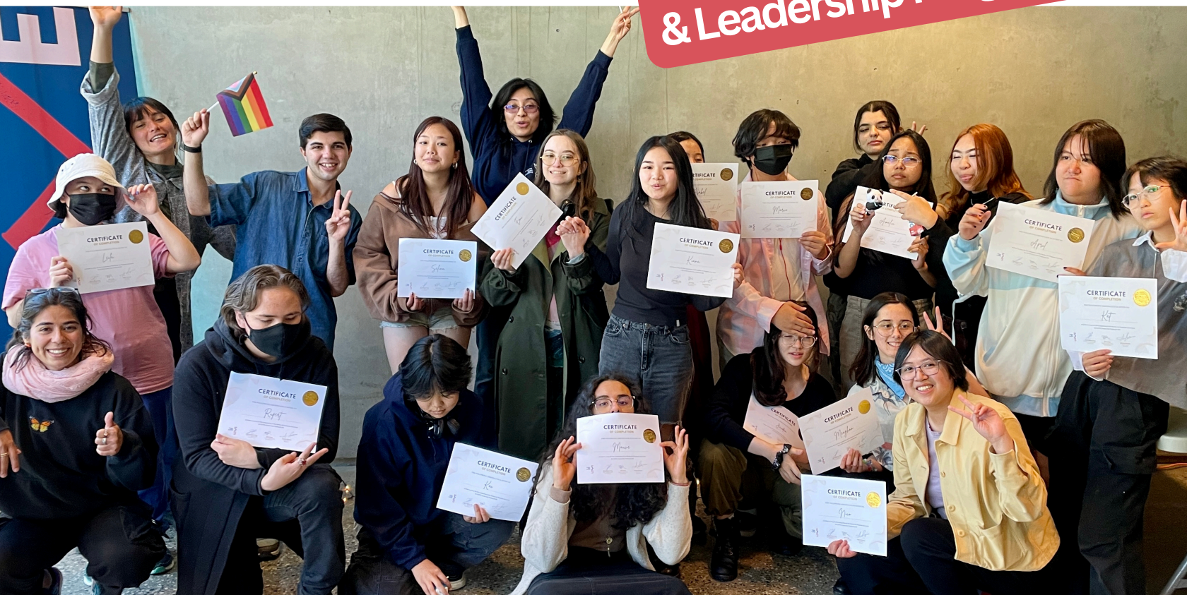
Graduation Ceremony at Granville Island, June 2024

737 youth in Media Art & Leadership Programs