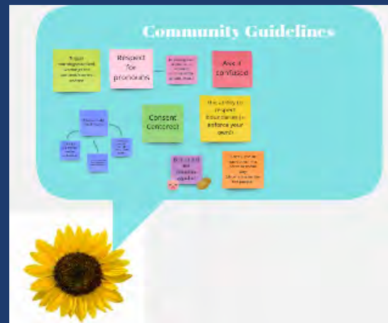
Above: Community Guidelines Miro Board

With respectful communication and a practice of self care, we engaged in some of the more difficult topics impacting individuals and communities. We recognize we all hold different life experiences, and as peers we are committed to listen to all voices in hangouts.