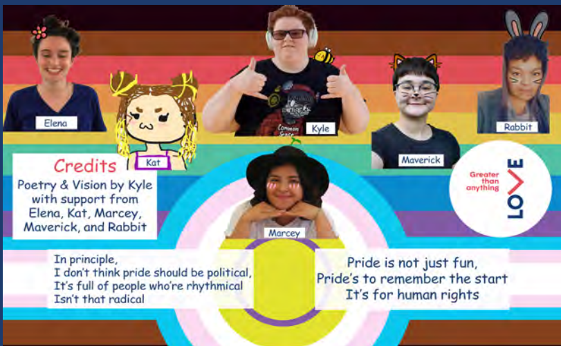
Above: LOVE BC's Virtual Pride Contributors

As some leadership folks transition to LOVE alumni, LOVE staff are excited to see them continue being amazing leaders in their community.