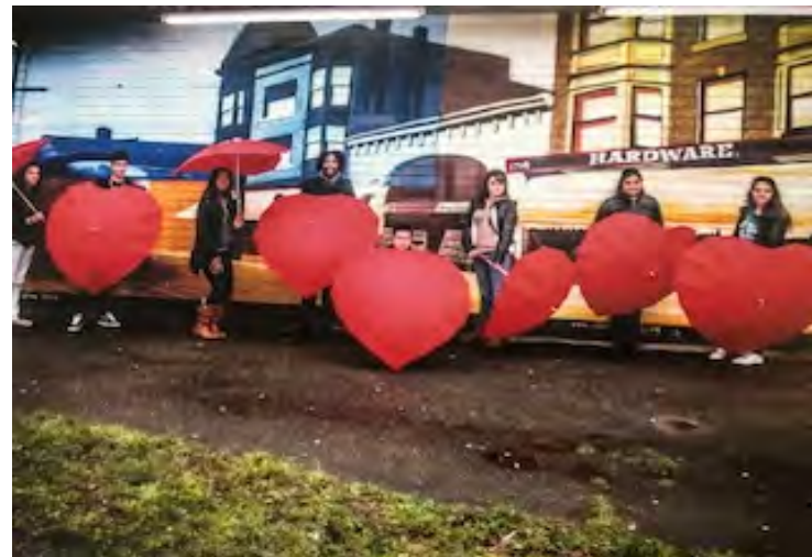
LOVE BC fundraising and awareness campaign 2013.

The committee started by looking at LOVE's past documents and looking to other related organizations to see what could be learnt. Once both documents were drafted they were provided to STAFF for feedback and input and then to the BOARD for further feedback. The feedback and input were incorporated and are now live documents. The terms of reference document is being used to guide the compliance committees work and will be useful when on boarding new committee members. The code of conduct is being used by staff and others who are work directly with LOVE.