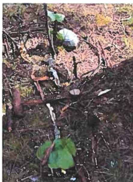
'Nature Art' - Youth Team @ Camp Potlach