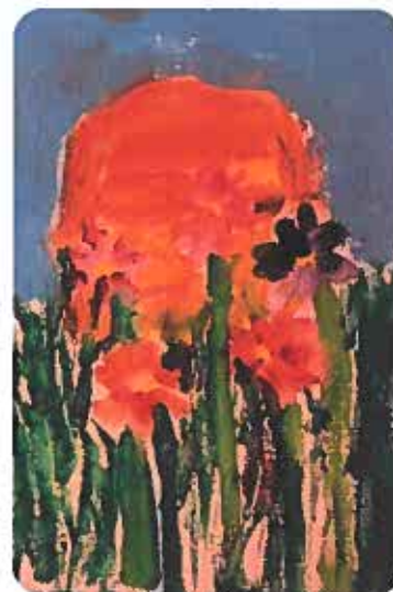
Acrylic painting by VW at MAP Vantech

MAP is a free after-school program where youth channel creativity through artistic mediums such as photography, film, and writing. Art is used as a vehicle to explore anti-violence and social justice issues affecting youth and their communities. The Media Arts Program (MAP) was held in person as of October 2021 in Burnaby, Surrey, and Vancouver.