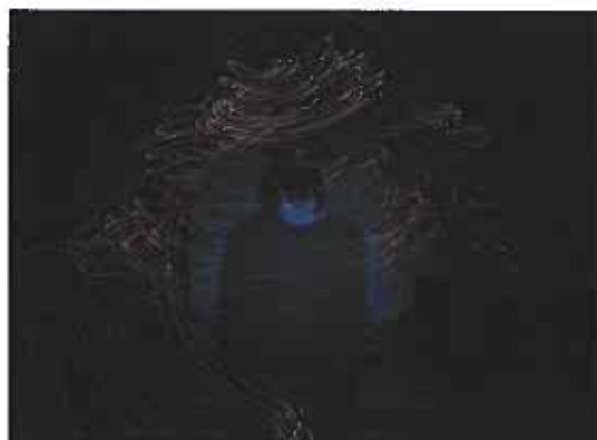
Light drawing by M at Camp Potlach

With much excitement, LOVE BC returned to Camp Potlach in 2022. This is a time when MAP and Leadership youths hone their skills by facilitating their own workshops on topics of interest. For many LOVE youth, LOVE Camp is their first time away from home or their first time having camp experiences like archery, hiking, water sports, and campfires.